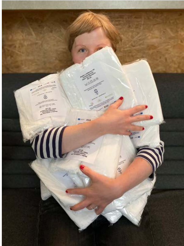
Production of masks for hospitals, One of the projects promoted thanks to the support of TISE

A few days later, the Chegos protected work cooperative contacted us to request a loan for the purchase of a disinfection machine , which allowed them to offer disinfection services for the interior of stores. In the months that followed, many hair and beauty salons turned to this cooperative when they reopened, as did restaurants and coffee shops.