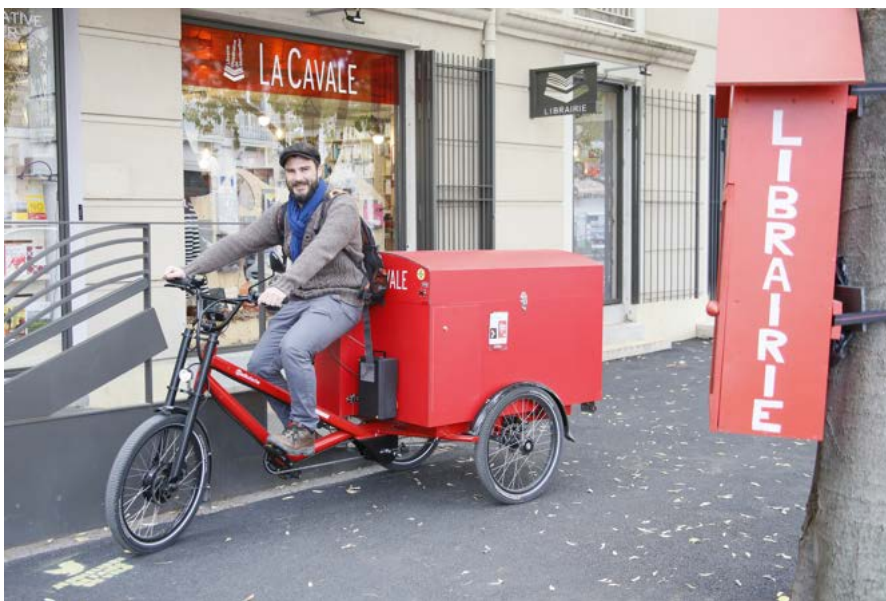
Librería La Cavale, una de las empresas apoyadas por France Active

For this phase CRESAÇOR has "intensified the monitoring and support already provided to microentrepreneurs", initially advising with documentation and the necessary procedures of the measures promulgated by the regional government, and later "supporting the preparation and presentation of requests". They also carried out, working together with partner entities, online trainings to share tools and strategies to face the crisis.